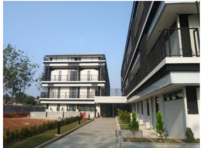
Atma Jaya's University Dormitory divides into 2 buildings for male and female students. Each room is occupied by 2 students.