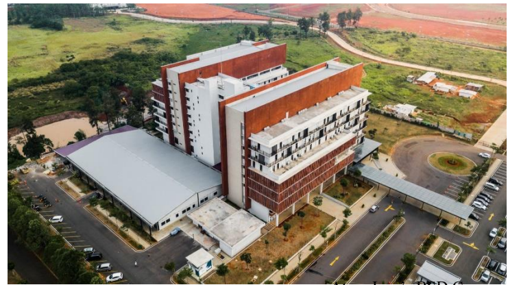
Atma Jaya's BSD Campus

*please use a currency converter like www.xe.com to find up to date exchange rates.