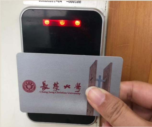
Student ID entry space