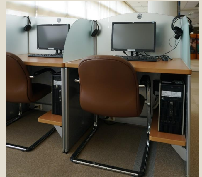
Language Learning Area