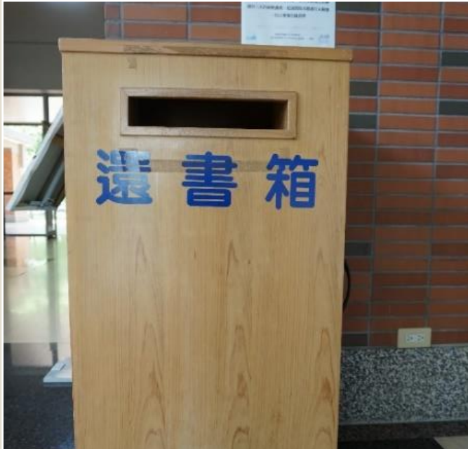
Book Drop in the lobby on the first floor