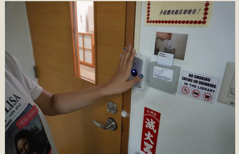
Spatial induction door to leave