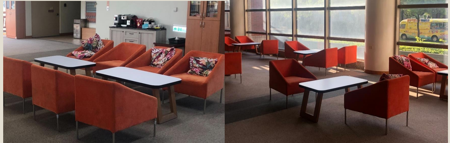
Alumni Services and Resource Development Center ( Free to chat and discuss )