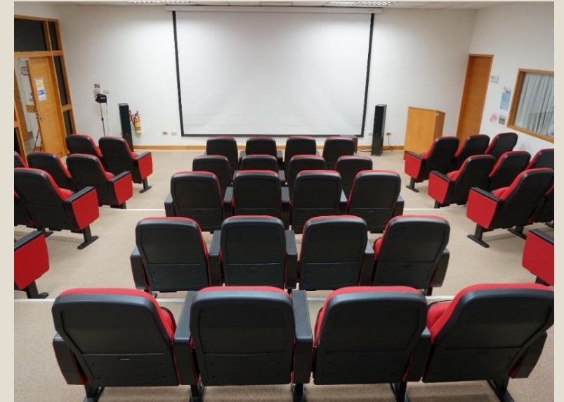
Large Multimedia room Use by more than 12 people