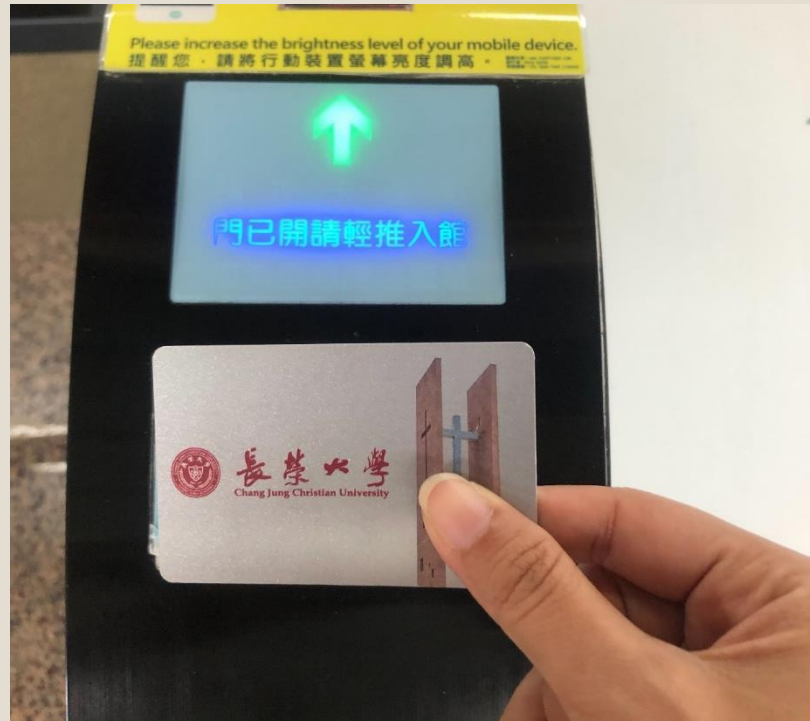
Student ID induction admission.