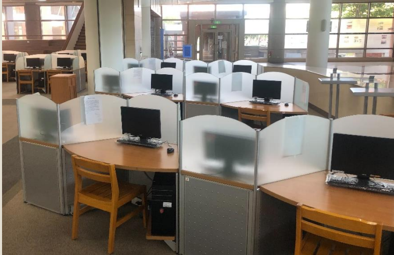
Information retrieval area