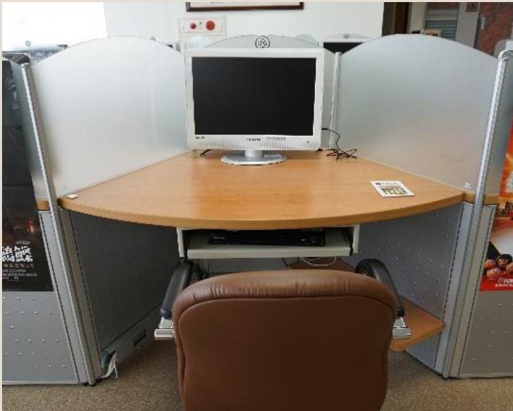
Personal Audio-Visual Area