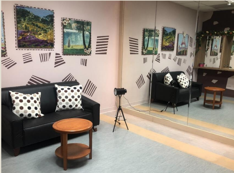
Multifunction room Use by more than 1 person