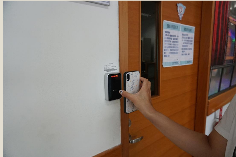
Use the QR code to enter the space