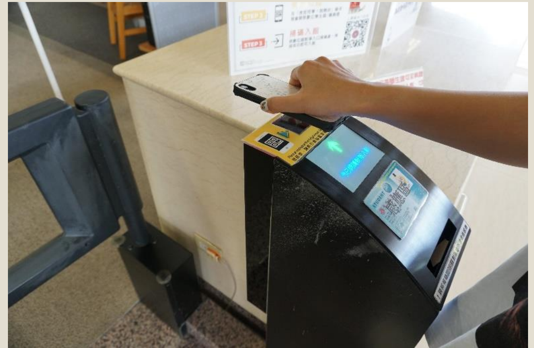
Digital student card admission.