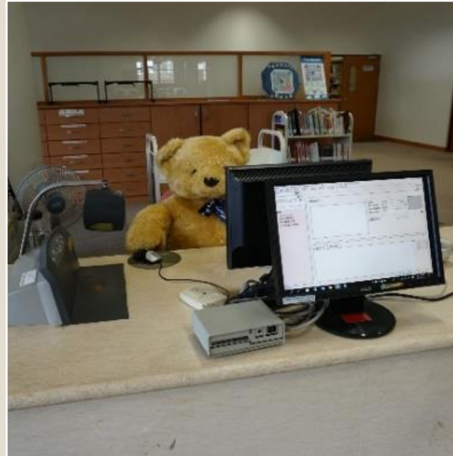
Circulation desk on the first floor