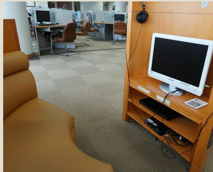
Dual Seat Audio-Visual Area