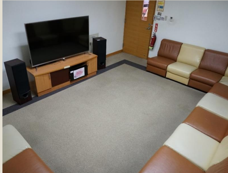
Small Multimedia room Use by more than 3 people