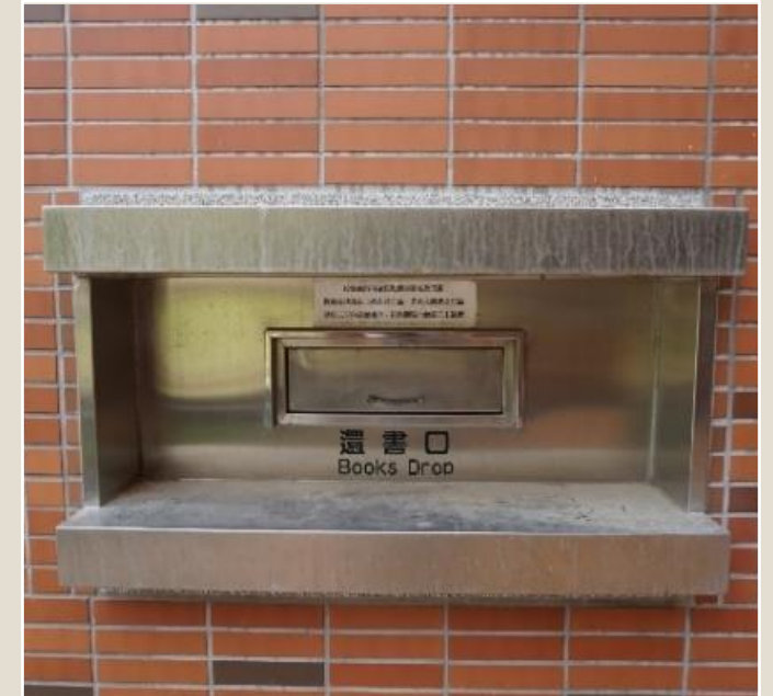
Book Drop outdoors